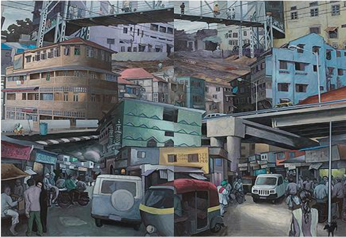
Sudhir Patwardhan: Painting, 2006. Image courtesy the artist